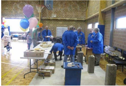
Members preparing for the onslaught of kids